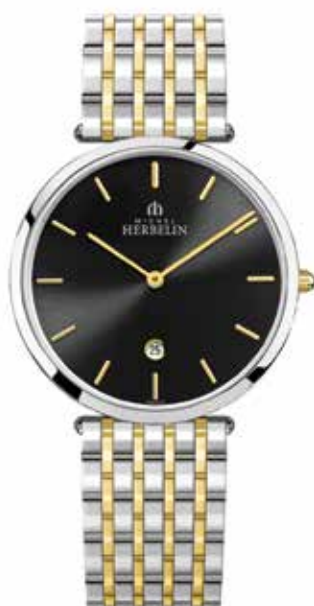
19416/BT14N Ø 38mm