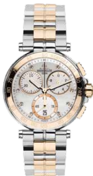
33696/BTR59 WR 100m Ø 34mm