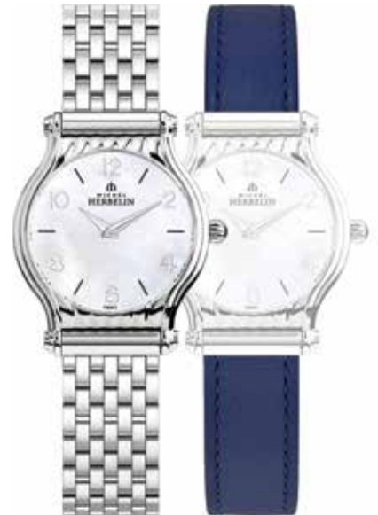
COF.17447/B29BL Ø 30mm