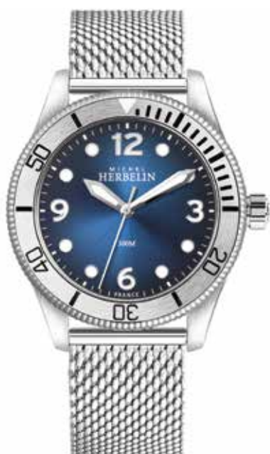
12260/15B WR 300m Ø 42mm

316L - Stainless steel Sapphire Crystal Screwed-down crown Water resistant 300 m.