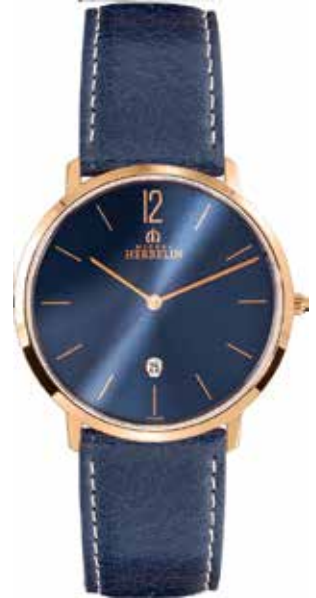
19515/PR15BL Ø 38.7mm