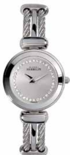
17125/B62 Ø 26mm