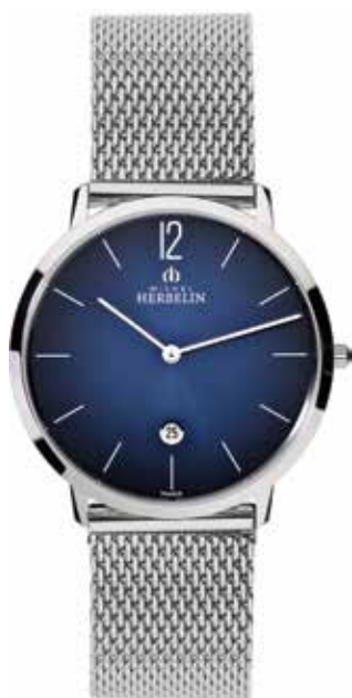
19515/15B Ø 38.7mm