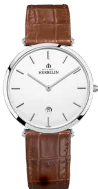
19406/11GO Ø 38mm