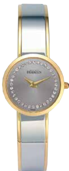
17056/BT62 Ø 28mm