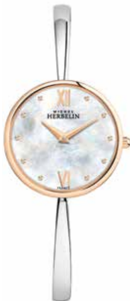
17418/BTR19 Ø 31mm