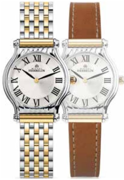
COF.17447/BT08G Ø 30mm