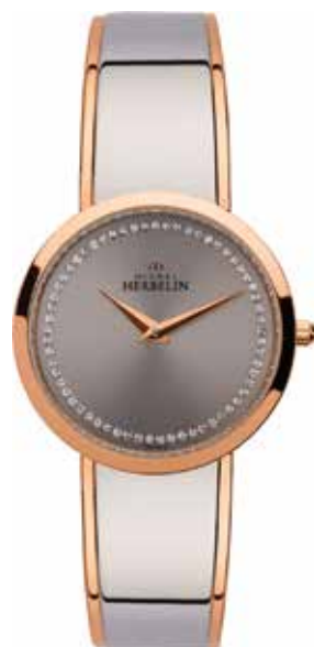
17082/BTR62 Ø 31mm