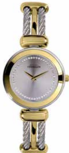
17125/BT62 Ø 26mm