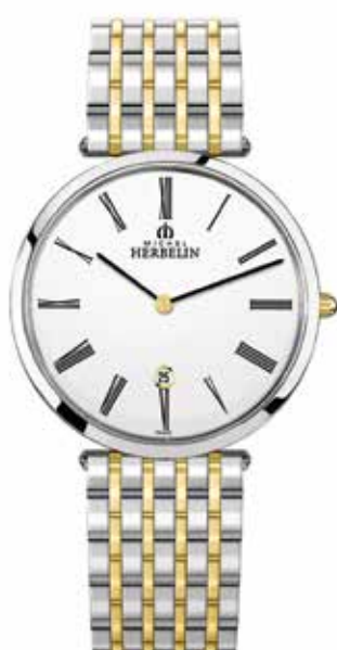
19416/BT01N Ø 38mm