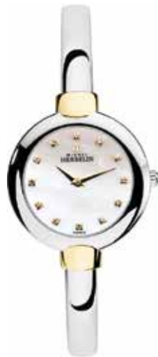
17413/BT59 Ø 26mm