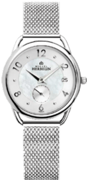
18397/29B Ø 34mm

Swiss Movement - Quartz 316L - Stainless steel Sapphire Crystal Water resistant 30 m.