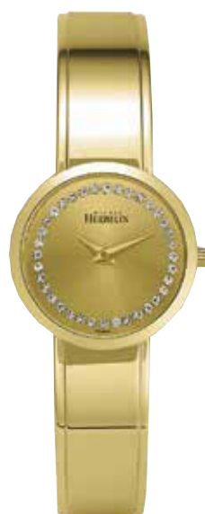
17056/BP63 Ø 28mm