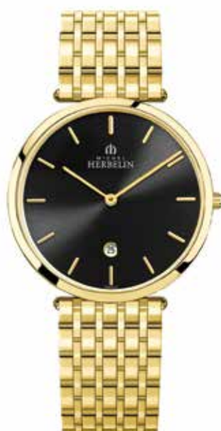
19416/BP14N Ø 38mm