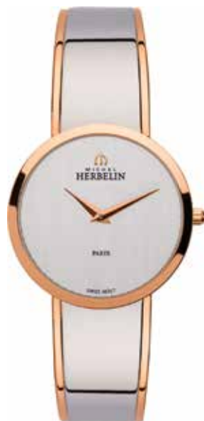
17082/BTR02 Ø 31mm