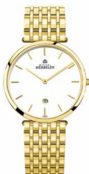
19416/BP11 Ø 38mm