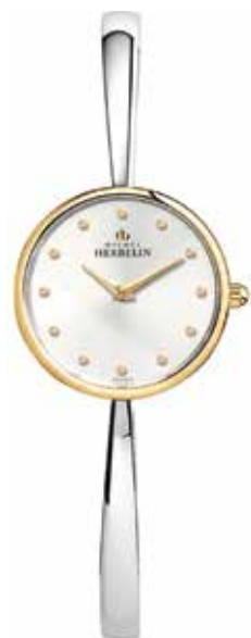
17408/BT52 Ø 26mm