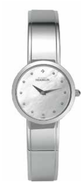
17056/B19 Ø 28mm

Swiss Movement - Quartz 316L Stainless steel High Grade Gold PVD Sapphire Crystal Water resistant 30 m.