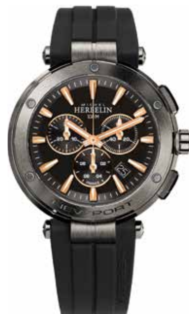
37688/G33TCA WR 100m Ø 43mm