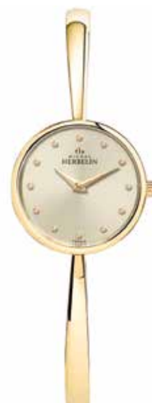
17408/BP53 Ø 26mm