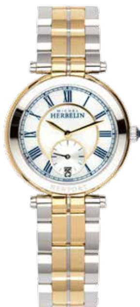
18384/BT29 WR 50m Ø 34mm