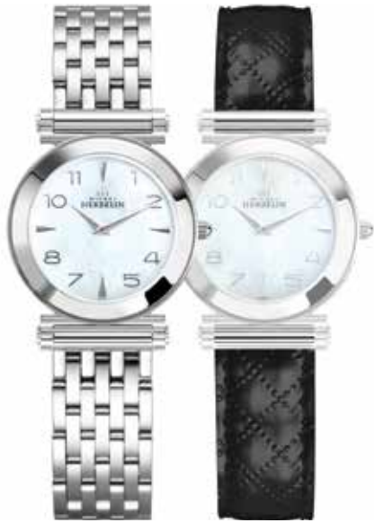
COF.17443/B19NB Ø 29mm