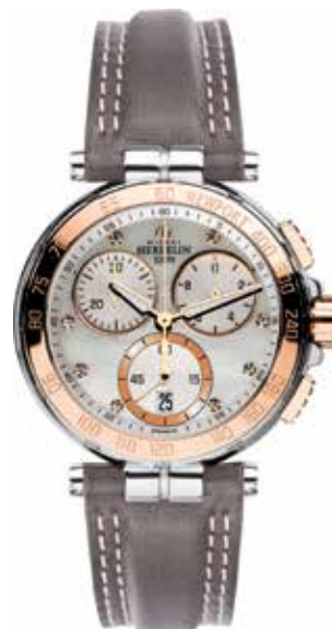
33656/TR59GR WR 100m Ø 34mm