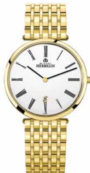
19416/BP01N Ø 38mm