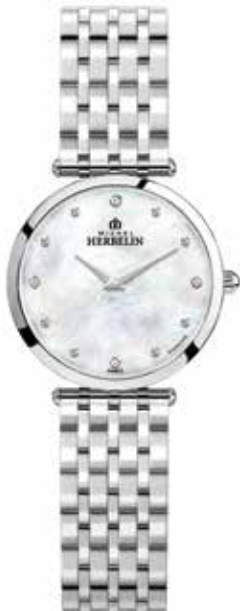
17116/B89 Ø 28mm