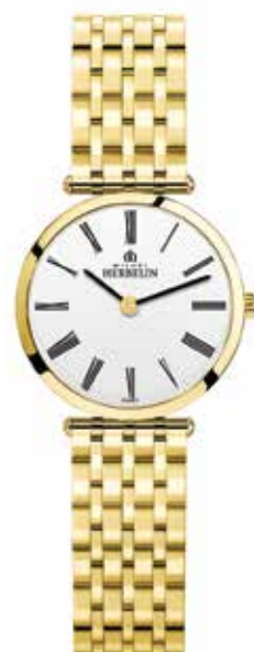
17116/BP01N Ø 28mm