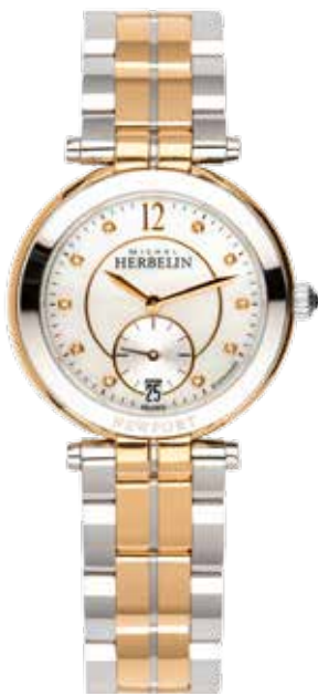
18384/BTR89 WR 50m Ø 34mm