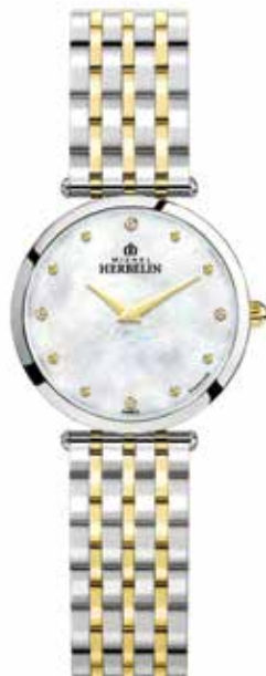
17116/BT89 Ø 28mm