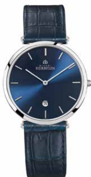
19406/15BL Ø 38mm