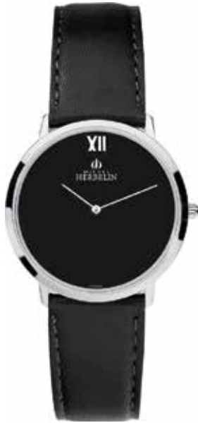
17415/04 Ø 36mm