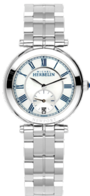
18384/B29 WR 50m Ø 34mm