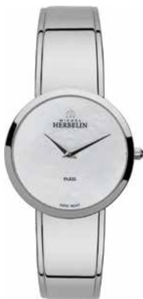
17082/B09 Ø 31mm

Stainless steel High Grade Gold PVD Sapphire Crystal Water resistant 30 m.