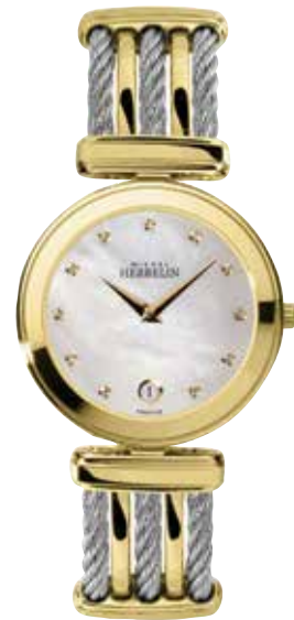
19415/BT59 Ø 31.5mm