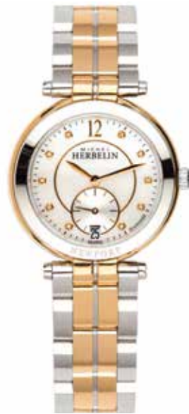
18384/BTR89 WR 100m Ø 34mm Diamond