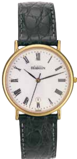
12443/P01 Ø 34mm