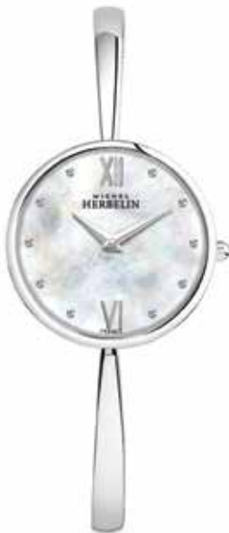
17418/B19 Ø 31mm