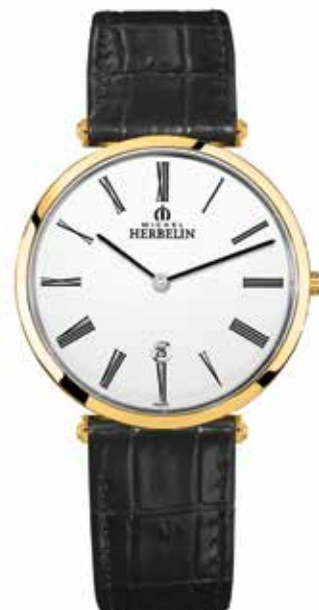
19406/P01N Ø 38mm