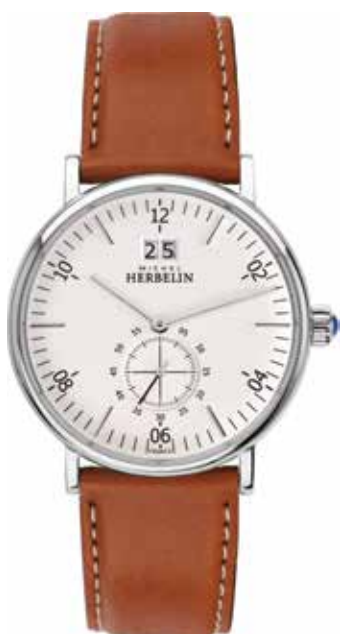
18247/11GO Ø 40mm