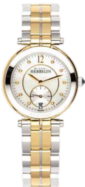
18384/BT89 WR 50m Ø 34mm