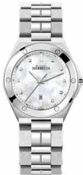
14245/B59 WR 100m Ø 34.5mm