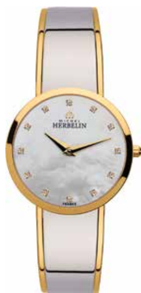
17082/BT59 Ø 31mm