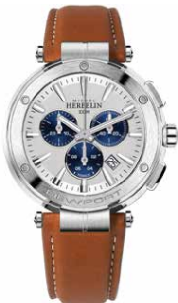
37688/42G0 WR 100m Ø 43mm