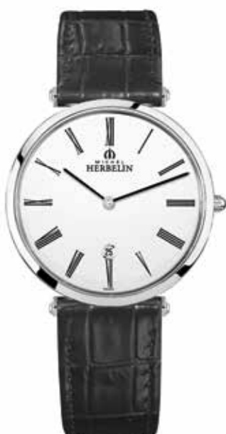
19406/01N Ø 38mm