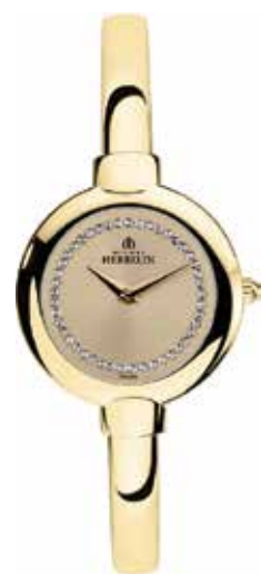
17413/BP63 Ø 26mm