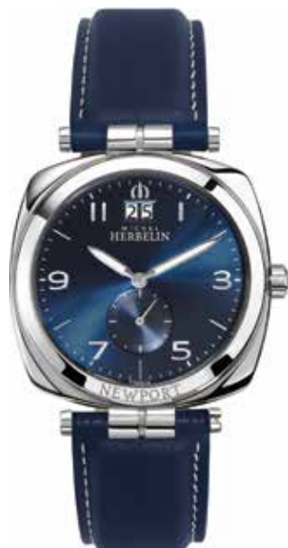
18264/AP15BL WR 50m Ø 38mm