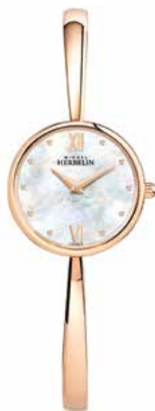
17408/BPR19 Ø 26mm