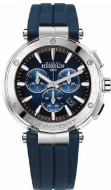
37688/35CB WR 100m Ø 43mm