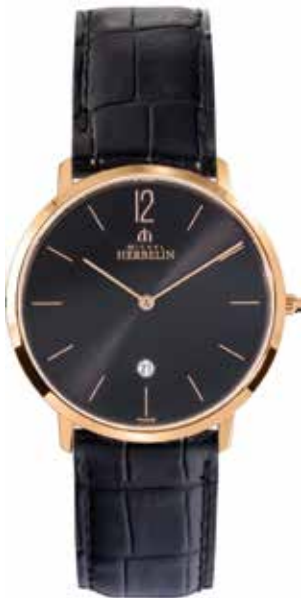
19515/PR14 Ø 38.7mm