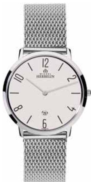
19515/21B Ø 38.7mm