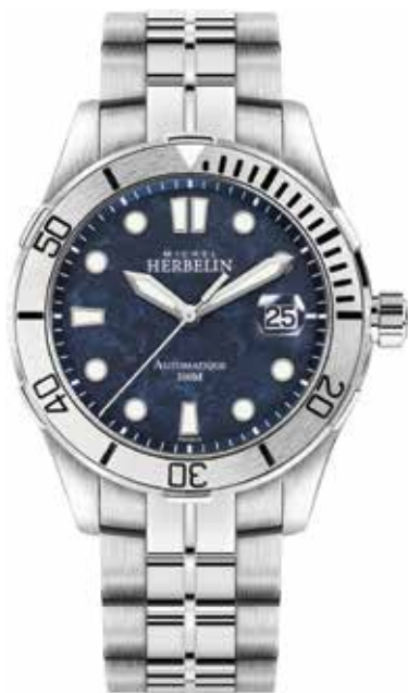
1660/45B WR 300m Ø 42mm

316L - Stainless steel Sapphire Crystal Screwed-down crown Water resistant 300 m.