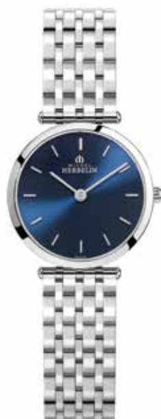
17116/B15 Ø 28mm