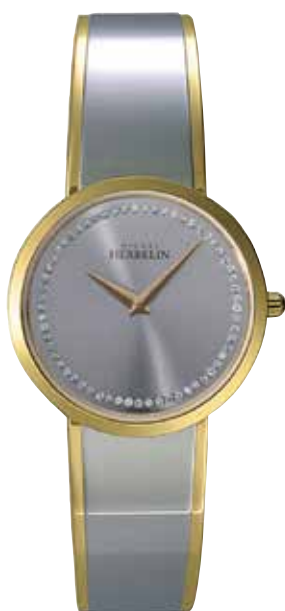
17082/BT62 Ø 31mm