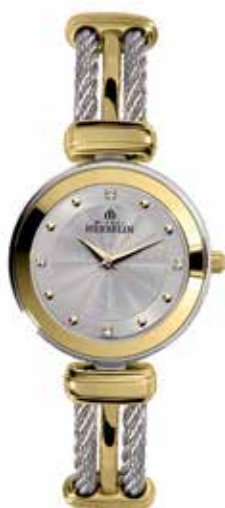
17125/BT12 Ø 26mm