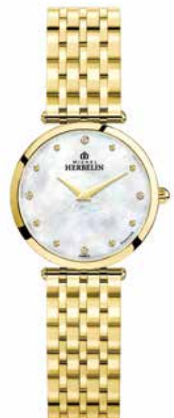
17116/BP89 Ø 28mm