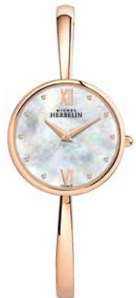
17418/BPR19 Ø 31mm