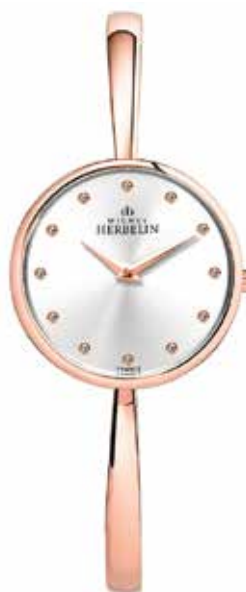
17418/BPR52 Ø 31mm