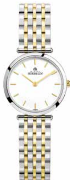
17116/BT11 Ø 28mm