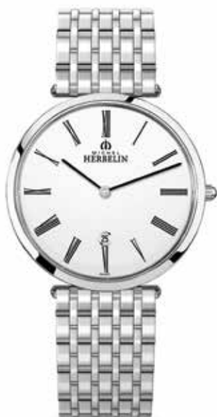
19416/B01N Ø 38mm