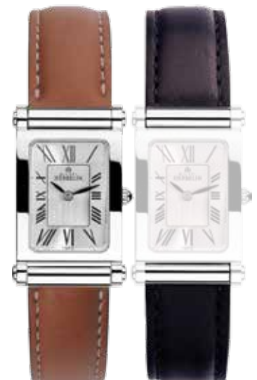
COF.17448/01NG Ø 19x32.2mm