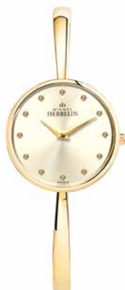
17418/BP53 Ø 31mm