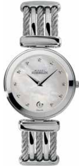
19415/B59 Ø 31.5mm