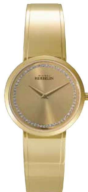
17082/BP63 Ø 31mm