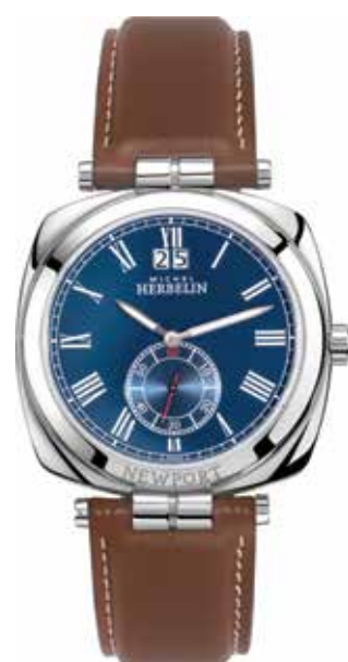
18264/AP05GO WR 50m Ø 38mm