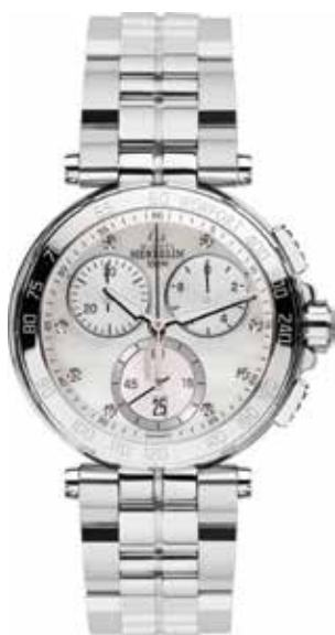
33696/B59 WR 100m Ø 34mm

Swiss Movement - Quartz 316L - Stainless steel Sapphire Crystal Water resistant 100 m.