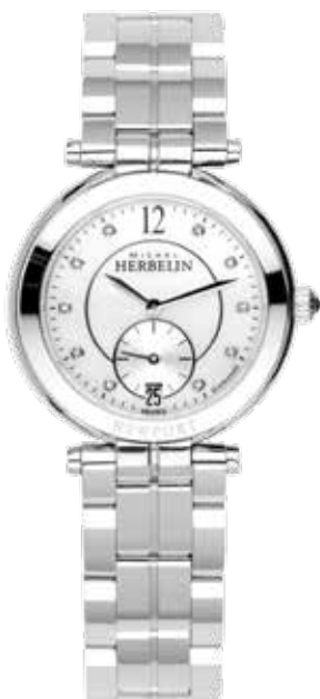
18384/B89 WR 50m Ø 34mm

Swiss Movement - Quartz 316L - Stainless steel Sapphire Crystal Water resistant 50 m.