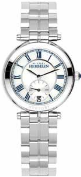
18384/B29 WR 100m Ø 34mm