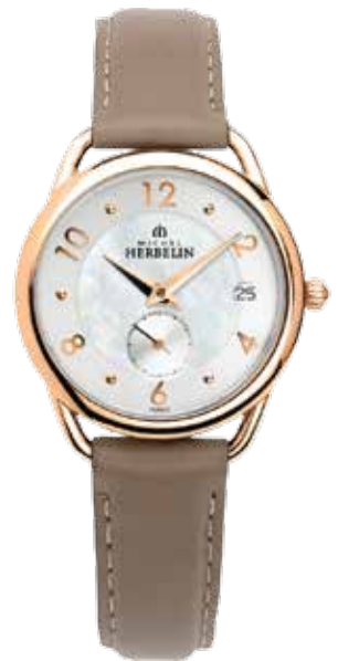
18397/PR29GR Ø 34mm