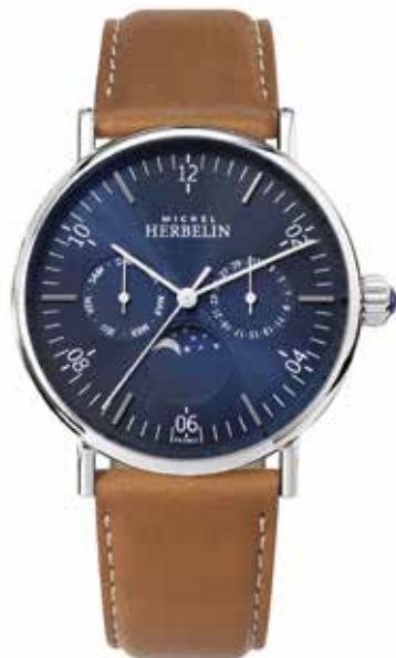
12747/AP15G0 Ø 38mm

Swiss Movement - Quartz 316L - Stainless steel Sapphire Crystal Water resistant 30 m.