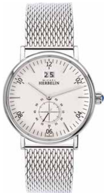
18247/11B Ø 40mm