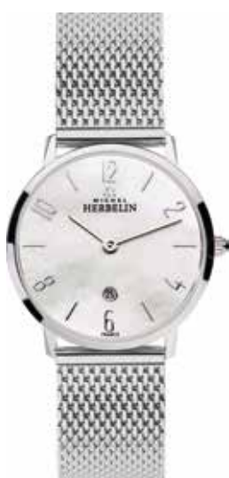
16915/29B Ø 30.5mm