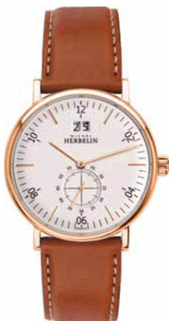
18247/PR11GO Ø 40mm