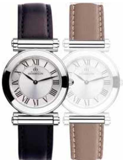
COF.17443/01NT Ø 29mm