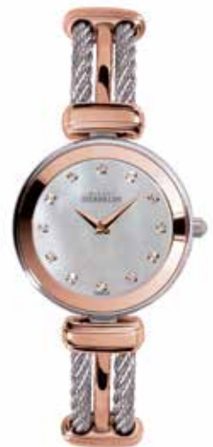
17125/BT4R59 Ø 26mm