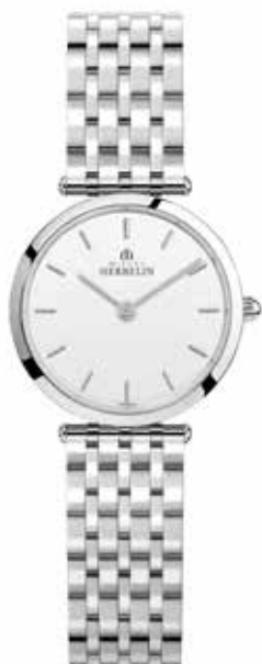
17116/B11 Ø 28mm