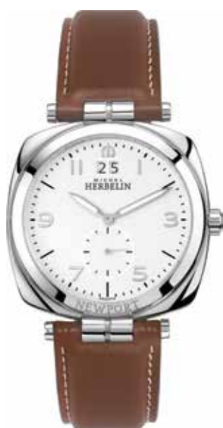
18264/AP11GO WR 50m Ø 38mm