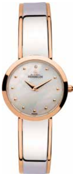
17056/BTR19 Ø 28mm