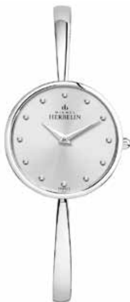
17418/B52 Ø 31mm