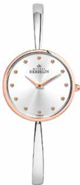
17418/BTR52 Ø 31mm

Stainless steel High Grade Gold PVD Sapphire Crystal Water resistant 30 m.