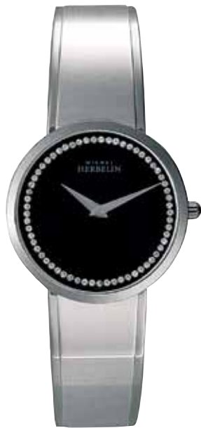
17082/B64 Ø 31mm