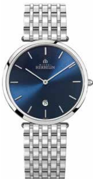
19416/B15 Ø 38mm