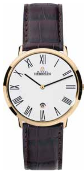
19515/PR01MA Ø 38.7mm