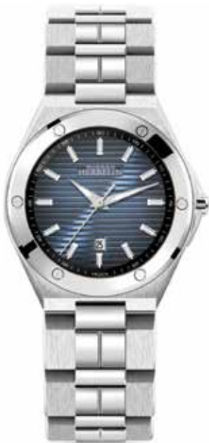
14245/B15 WR 100m Ø 34.5mm

Swiss Movement - Quartz 316L - Stainless steel Sapphire Crystal Water resistant 100 m.