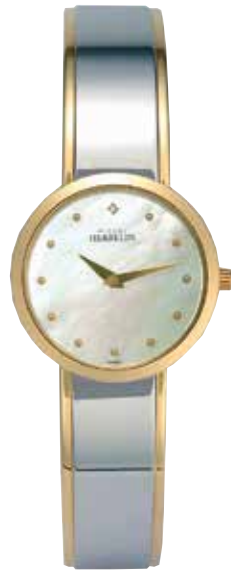
17056/BT19 Ø 28mm