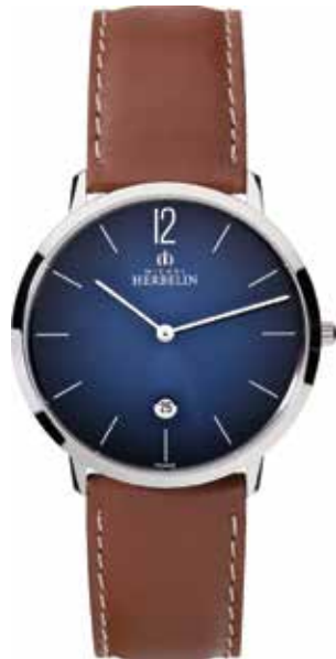
19515/15 Ø 38.7mm