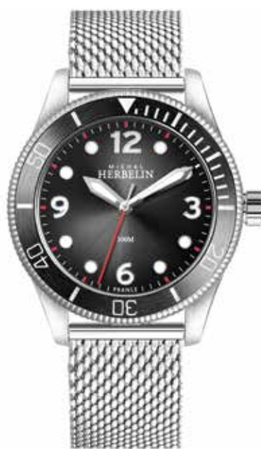
12260/AN14B WR 300m Ø 42mm