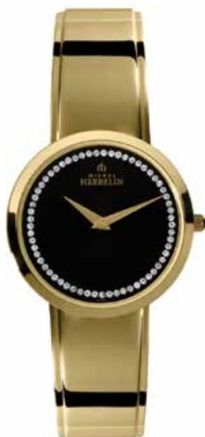
17082/BP64 Ø 31mm