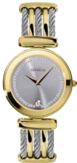
19415/BT62 Ø 31.5mm