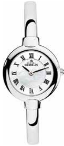
17413/B29 Ø 26mm