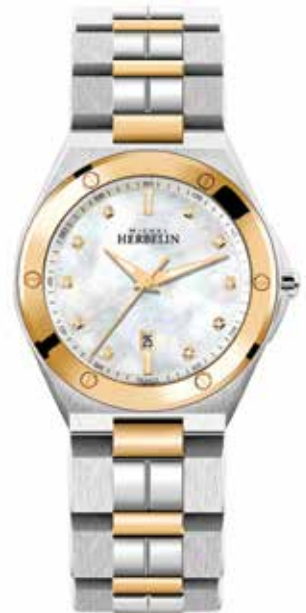
14245/BTR59 WR 100m Ø 34.5mm