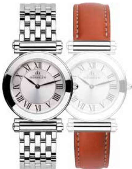
COF.17443/B01GO Ø 29mm