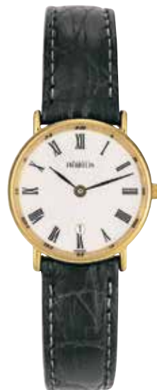
16845/P01 Ø 26mm