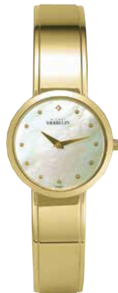
17056/BP19 Ø 28mm