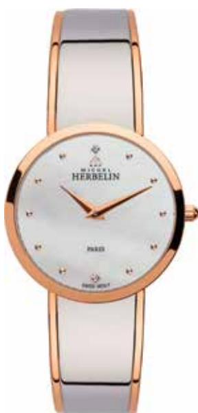
17082/BTR19 Ø 31mm