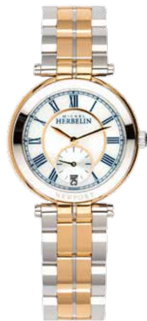
18384/BTR29 WR 50m Ø 34mm