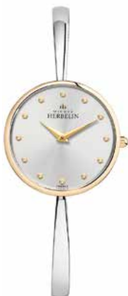
17418/BT52 Ø 31mm