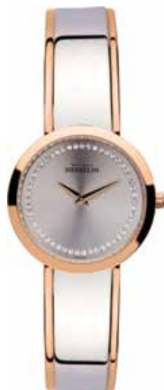
17056/BTR62 Ø 28mm