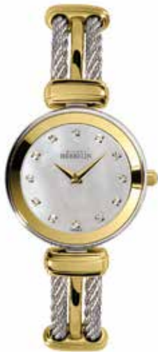
17125/BT59 Ø 26mm