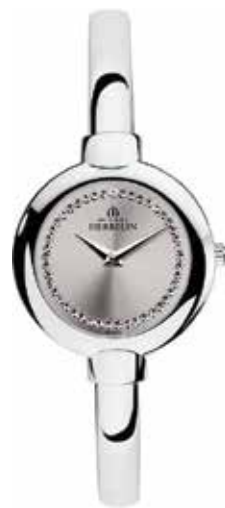
17413/B62 Ø 26mm