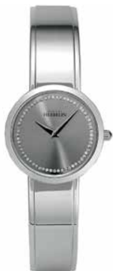
17056/B62 Ø 28mm

Stainless steel High Grade Gold PVD Sapphire Crystal Water resistant 30 m.