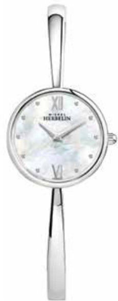
17408/B19 Ø 26mm