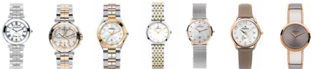
Newport Classics 16