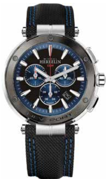
37688/AG65 WR 100m Ø 43mm

Swiss Movement - Quartz 316L - Stainless steel Titanium PVD Sapphire Crystal Water resistant 100 m.