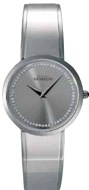
17082/B62 Ø 31mm

Stainless steel High Grade Gold PVD Sapphire Crystal Water resistant 30 m.