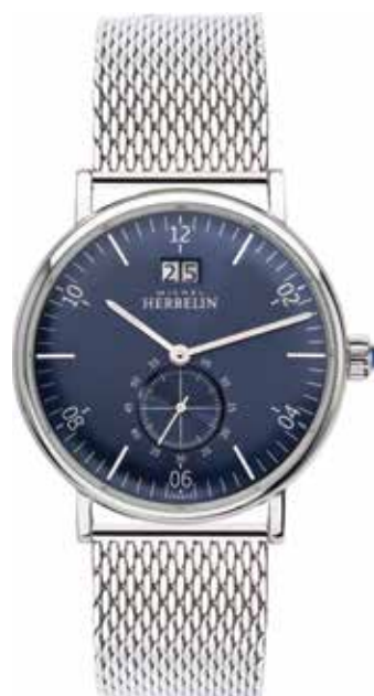
18247/15B Ø 40mm