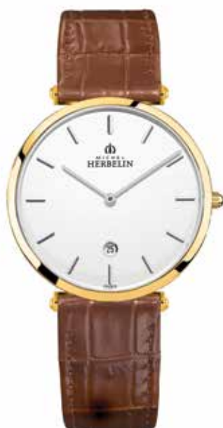
19406/P11GO Ø 38mm