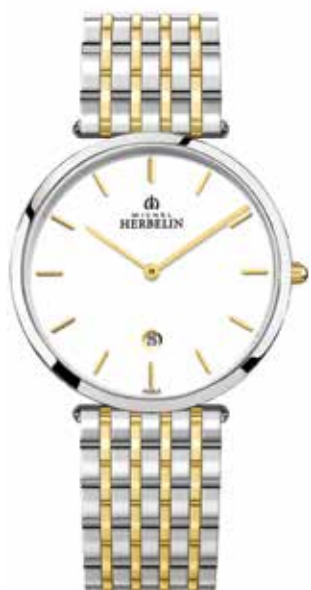
19416/BT11 Ø 38mm