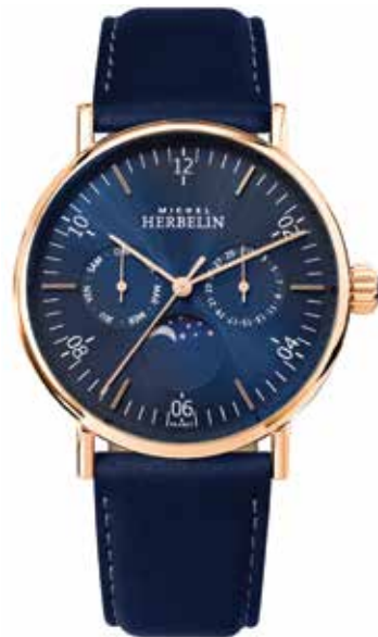
12747/PR15BL Ø 38mm