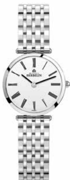
17116/B01N Ø 28mm