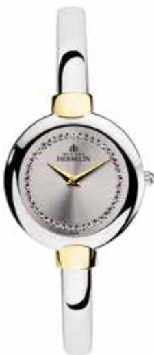
17413/BT62 Ø 26mm