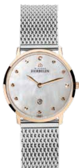
16915/PR59B Ø 30.5mm