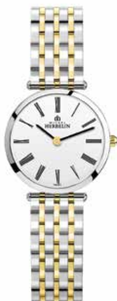
17116/BT01N Ø 28mm