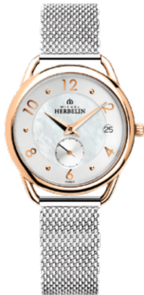
18397/PR29B Ø 34mm