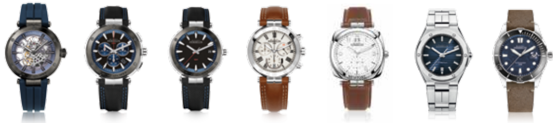
Newport Automatic 8