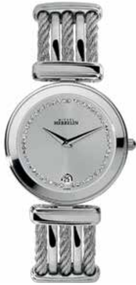
19415/B62 Ø 31.5mm