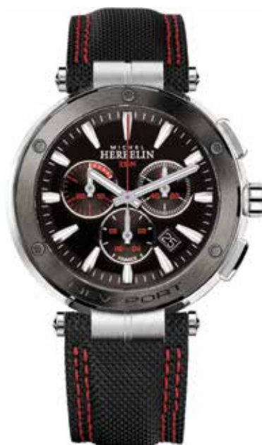
37688/AG44 WR 100m Ø 43mm